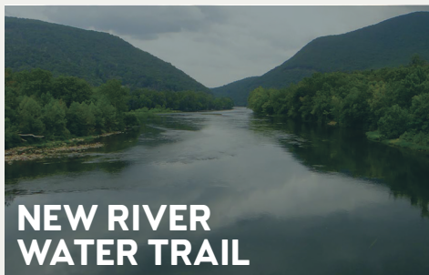
NEW RIVER WATER TRAIL

Giles County has made an effort to make the New River more accessible than ever. Tons of boat launches and docks are available for paddlers, boaters, and floaters of any skill level. When you're ready for your next adventure, look to the New River Water Trail.